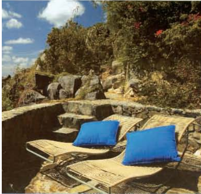
Clockwise from top left: Curved lounge sitting on a secret patio at the cliff's edge; tucked on a ledge, this private bedroom overlooks dramatic cliffs and sea views; a gazebo with a staircase leads down to another section of the estate.